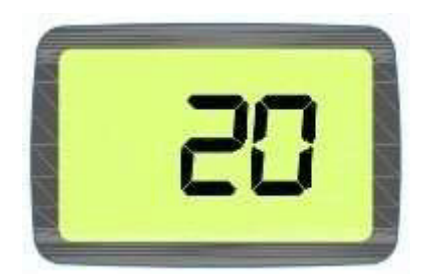
Extended channels are presently disabled and will be enabled