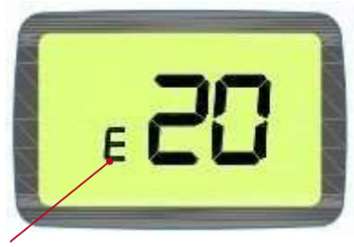
Extended channels are presently enabled and will be disabled